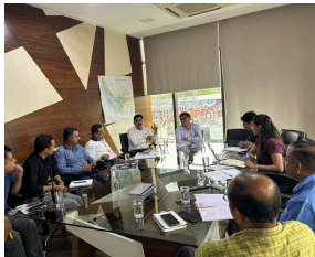
Operation Section 05-07-24