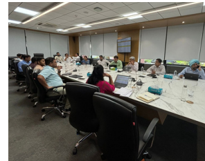
Logistic Section 16-07-24